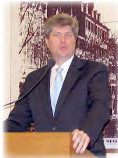
First District Representative Jeff Fortenberry