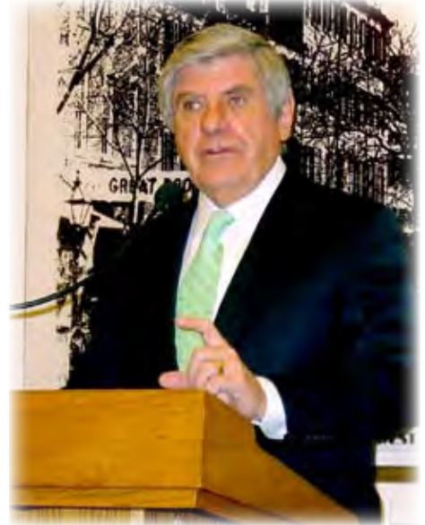
Nebraska Senator Ben Nelson