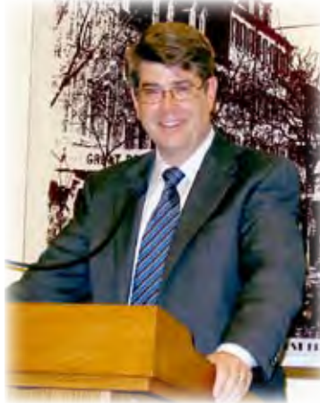
Second District Representative Lee Terry

The group spent one-on-one time with Nebraska Senator Ben Nelson and Nebraska Representatives Jeff Fortenberry , Lee Terry and Adrian Smith .