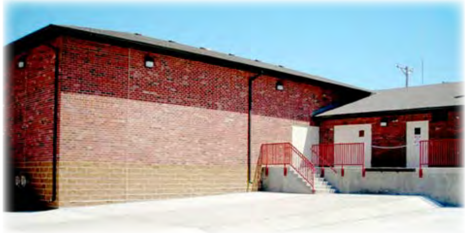
Louisville water treatment plant.

Estimated at $2.2 million, the design of facility was completed by the JEO Consulting Group in 2005. It's targeted to go on-line in 2008. —from The Link , JEO Consulting Group